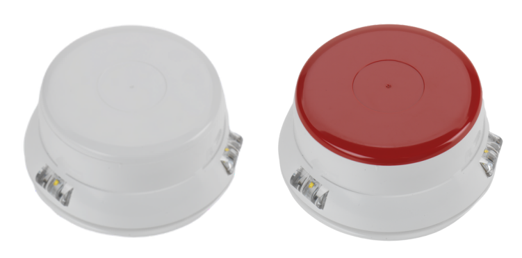
White blanking cap