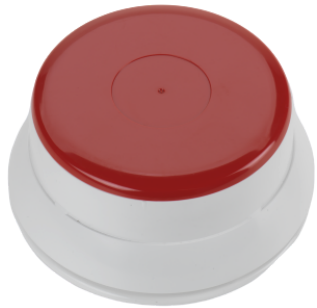
White blanking cap